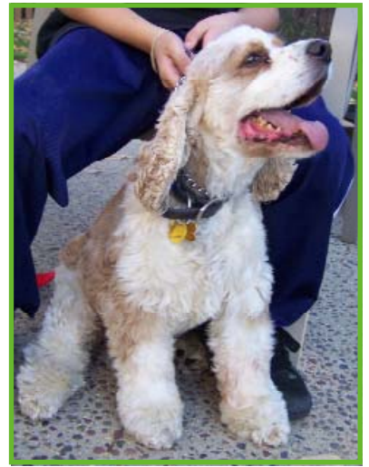
Buddy - 7 yrs. A friendly, housetrained boy who loves humans and other animals.

Help Shorewood as you shop online this holiday season! Every cent counts.