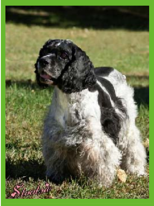
Stootsie - 8yrs.

Have you ever been let out in the cold? Literally or figuratively? Do you remember how you felt? Well, that is exactly what happened to Shorewood's Stootsie.