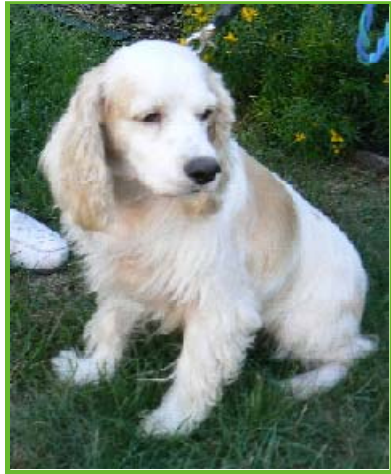
Shady - 9 yrs. Full of energy, loves car rides and gets along with others.

As was the case with the rest of the country, 2010 was a difficult year in rescue. Many rescues did not survive the year either due to lack of funds or volunteers. The shortage of foster homes is critical. As the number of dogs needing help increases, it seems that the number of people willing to help diminishes. Hopefully, people will find it in their hearts to open their homes to one of these innocent creatures this holiday season. Shorewood is fortunate in that we do have a core group of people who have been with us for years. The key words are "have been with us for years". We are not getting any younger. We need some new blood. This holiday season when you look at your Shorewood dog, keep in mind that he might not be alive today but for a person who unselfishly opened their home to him.